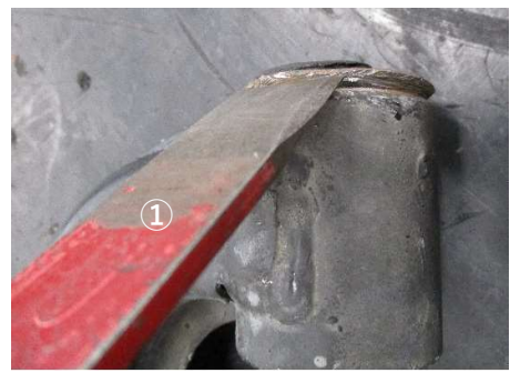
1. Raise the flange of No.1 and No.2 bushes with chisel (1).

(To insert the teeth of the bearing remover) (enlarged photo of 2) Be careful not to deform the arm side.