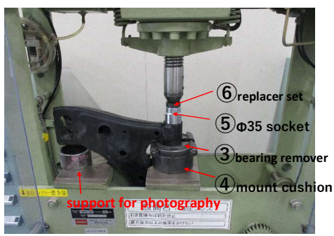
4. Set the preparation tool and lower arm to the