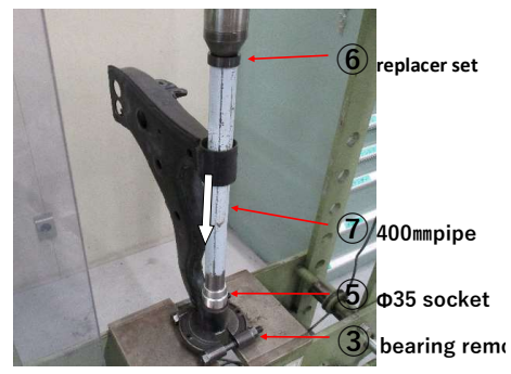
6. Pull out the No.2 bush by