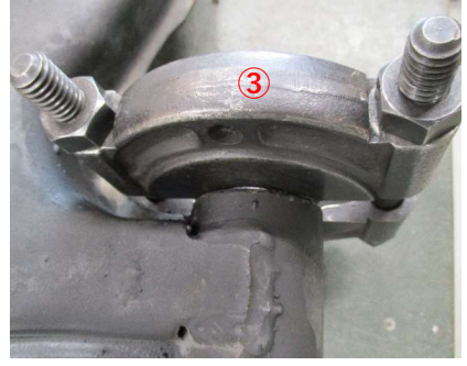
{\bf 2} . Install the bearing remover {\bf 3} between the raised flange and lower arm.

(To insert the teeth of the bearing remover) (enlarged photo of 2) Be careful not to deform the arm side.