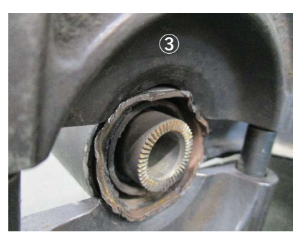
3. To remove the bush, apply a load to the bush from the side without the flange. Sandwich the bearing with the bearing remover 3 so that the lower arm can be